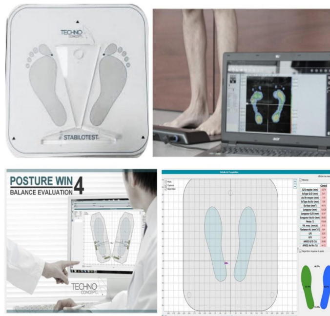
Figure 2. Stabilometric force platform (posture Win© 4).

Postural Balance was evaluated using a static stabilometric platform (posture Win©, Techno Concept®, Cereste, France; 40 Hz frequency, 12 bit A/D conversion) (Figure 2). It records the center of pressure (CoP) sways with three strain gauges. Participants were instructed to stand barefoot, as immobile as possible, on the force platform in an upright bipedal posture with their arms comfortably positioned downward at either side of the body. Their bare feet were separated by an angle of 30^\circ while their heels were placed 5 cm apart. Postural measurements were collected in two vision conditions. In the eyes open (EO) condition, participants were instructed to keep their gaze horizontal in a visual target positioned 2 m away.